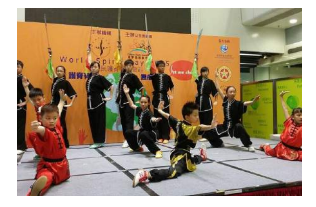
Martial arts groups demonstrating the benefit of exercise to spinal health.