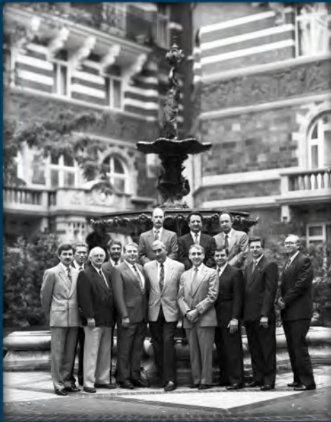
WFC COUNCIL 1993, LONDON

THE GLOBAL ADVANCE OF CHIROPRACTIC: WFC 1988-2013