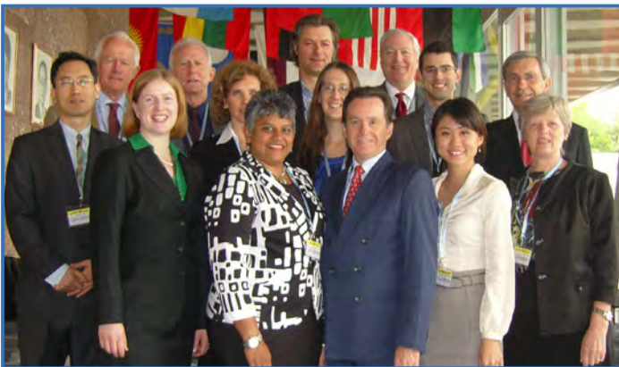
Members of WFC delegation