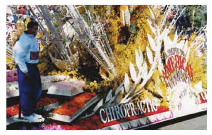
Tiger Woods at the Rose Parade