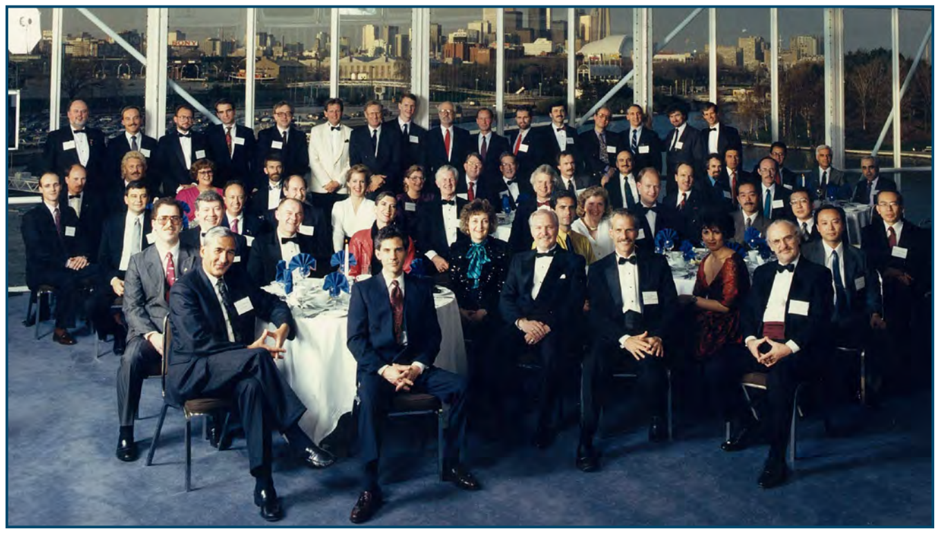
Gala Banquet on May 4, 1991 at the WFC's First Congress.