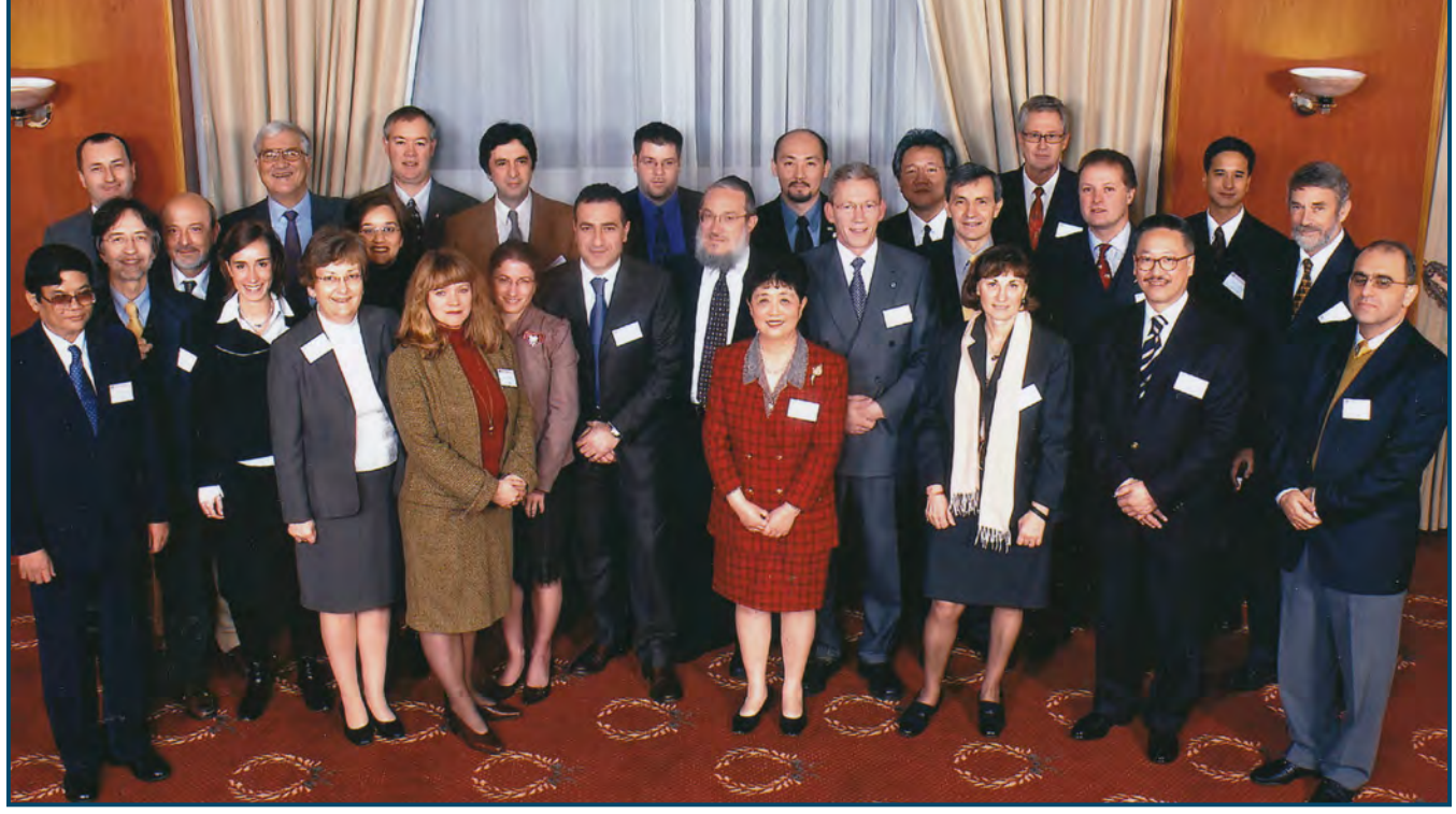
WHO December 2004.