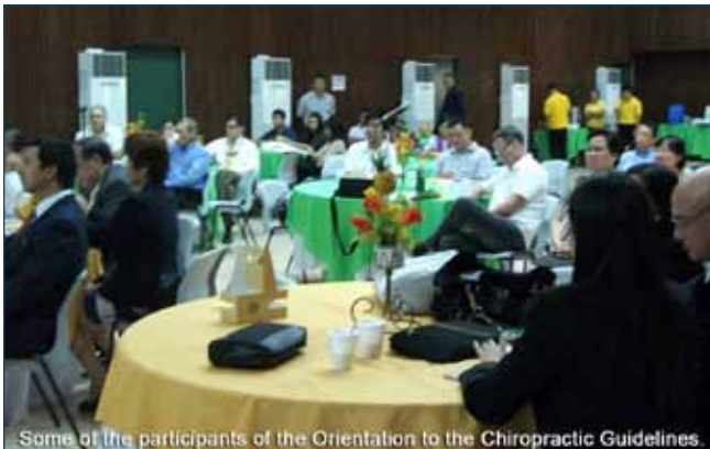
Some of the participants of the Orientation to the Chiropractic Guidelines.