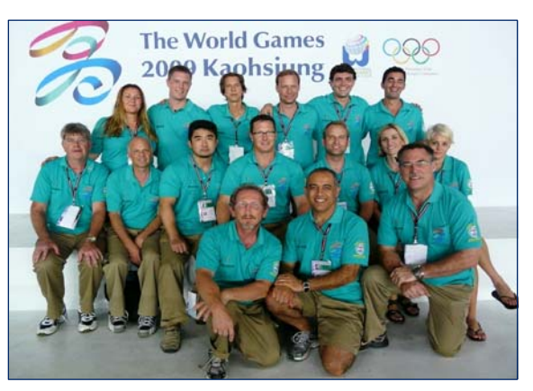
Some members of the FICS team