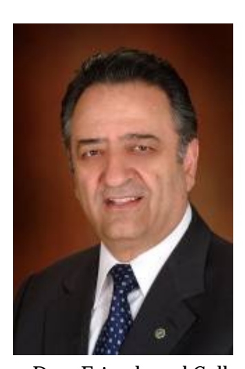
Dear Friends and Colleagues:

In my first President's Message in June I spoke of how I was from Cyprus in one of the four world regions — Africa, Asia, Eastern Mediterranean and Latin America, where chiropractic is underrepresented, challenged and in need of our strongest possible support to prevent other professionals and lay persons claiming chiropractic as their own.