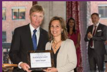
New humanitarian award given at Nobel Peace Prize venue.