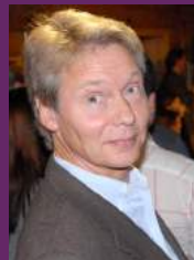
Meet the new WFC President

President's Message World News Forthcoming Events ...and more!