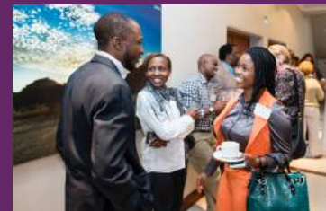
World Spine Care Conference brings together all professions.