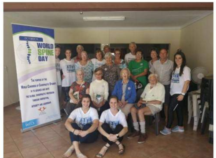
As part of WCCS, the University of Johannesburg held sunrise Yoga classes, a Fun Run and promoted physical activity in the elderly.