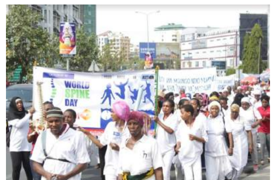
Ceragem Tanzania organized a rally to celebrate World Spine Day and increase awareness of spinal disorders.