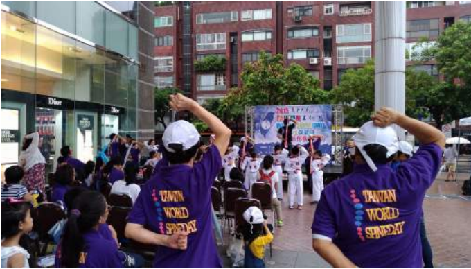
Taiwan Chiropractic Doctors' Society held open-air dance performances, exercise classes and martial arts exhibitions to promote World Spine Day