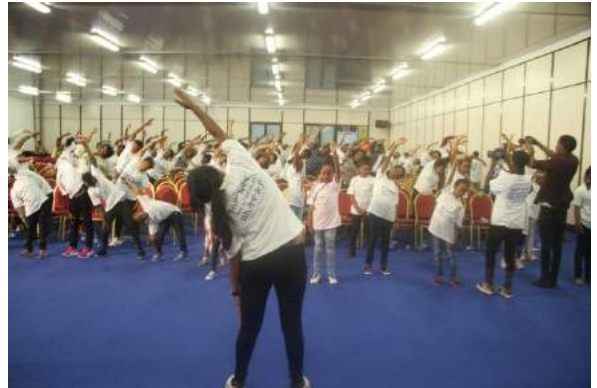
In Ethiopia, WFC competition prize winners, First Chiropractic Wellness and Rehabilitation offered Aser-Le-Tena workshops to eager participants