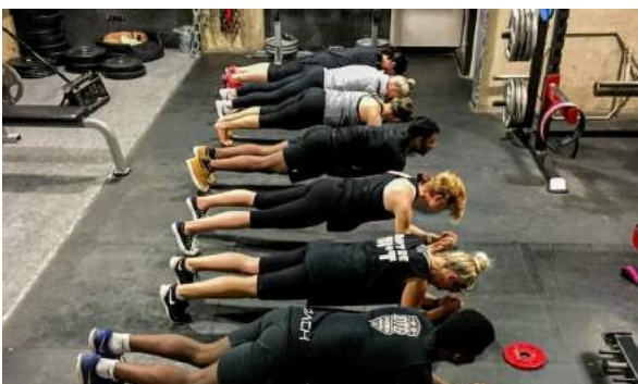
In South Africa, Grant & Wiggett Chiropractic offered free spinal screenings, a plank challenge at local gym and a spinal health talk.