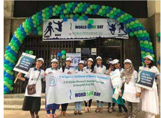
ZH Sikder Institute of Neurosciences organized an early morning awareness rally and exercise demonstration in Bangladesh