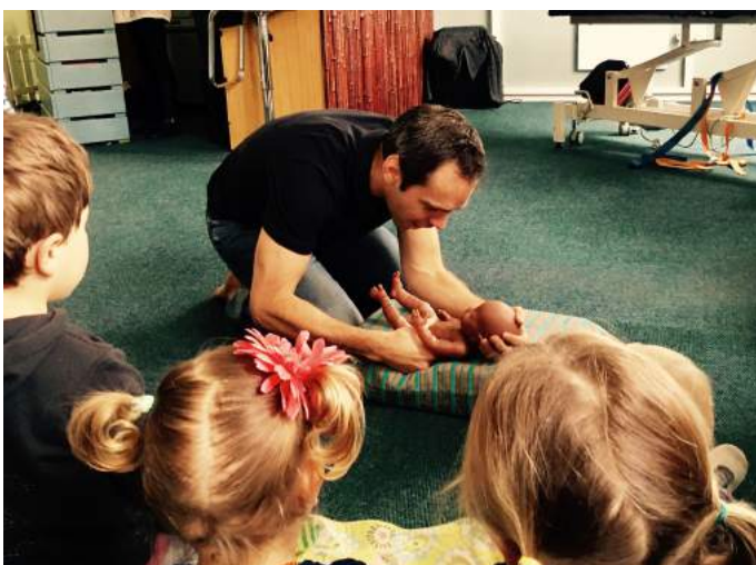
WFC Competition Individual Clinic winner Peak Chiropractic raised awareness of spinal health in children and infants.