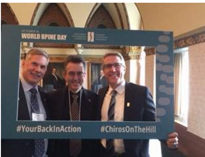
WFC Competition Winners, Canadian Chiropractic Association promoted World Spine Day in Government and across Canada.

World Spine Day takes place on October 16 each year and is coordinated by the WFC. With over 550 official partners spread across each of the WFC's 7 world regions, this year's theme of "Your Back In Action" prompted a huge range of activities. Here are just a few!