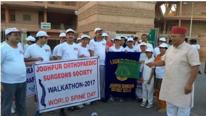
The Jodhpur Orthopaedic Surgeons' Society conducting a walkathon to promote World Spine Day