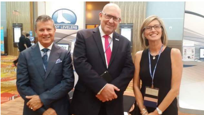
Premier Corporate Partner, Foot Levelers