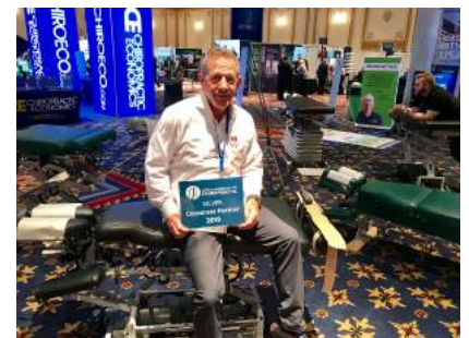
Silver Corporate Partner, Lloyd Tables