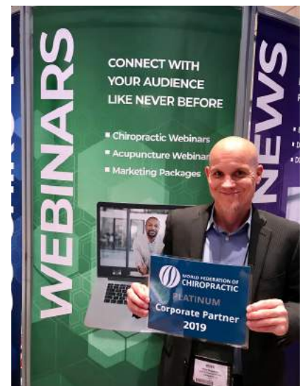
Platinum Corporate Partner, Dynamic Chiropractic