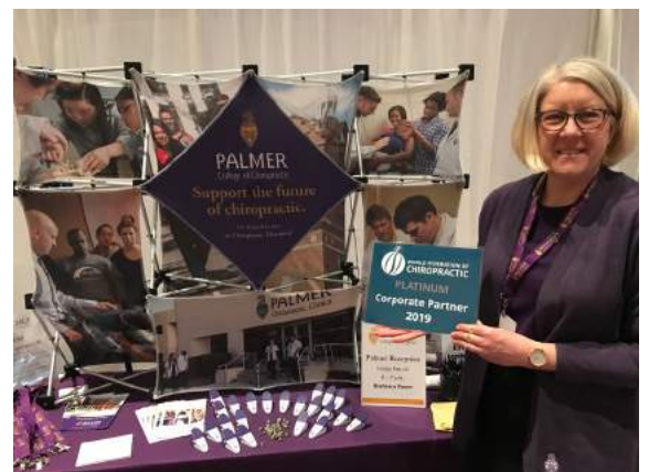
Platinum Corporate Partner, Palmer College of Chiropractic