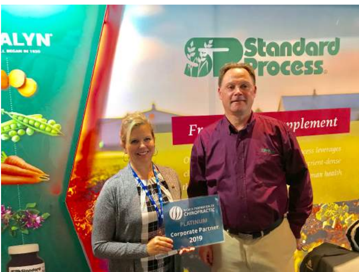
Platinum Corporate Partner, Standard Process