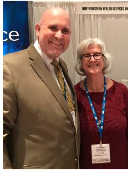
Gold Corporate Partner, Northwestern University of Health Sciences