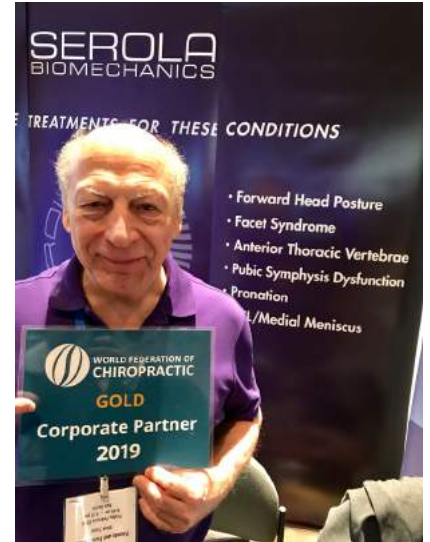
Gold Corporate Partner, Serola Biomechanics