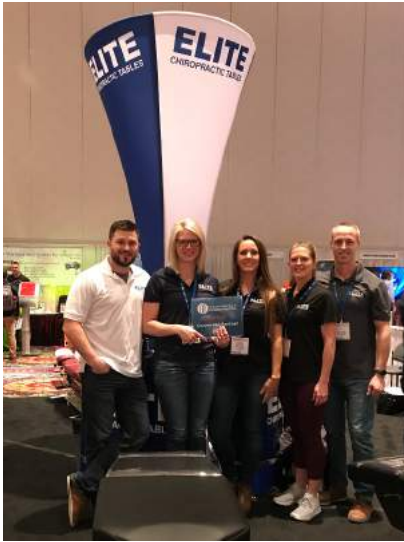
Bronze Corporate Partner, Elite Chiropractic Tables