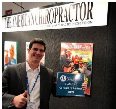
Diamond Corporate Partner, The American Chiropractor