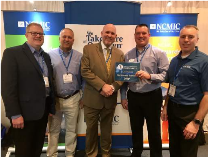
Platinum Corporate Partner, NCMIC Group