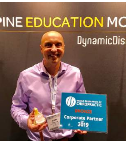
Bronze Corporate Partner, Dynamic Disc Designs