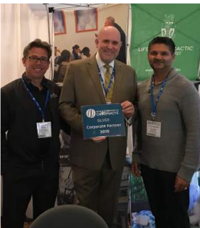
Silver Corporate Partner, Life Chiropractic College West