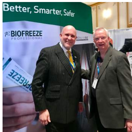
Gold Corporate Partner, Performance Health